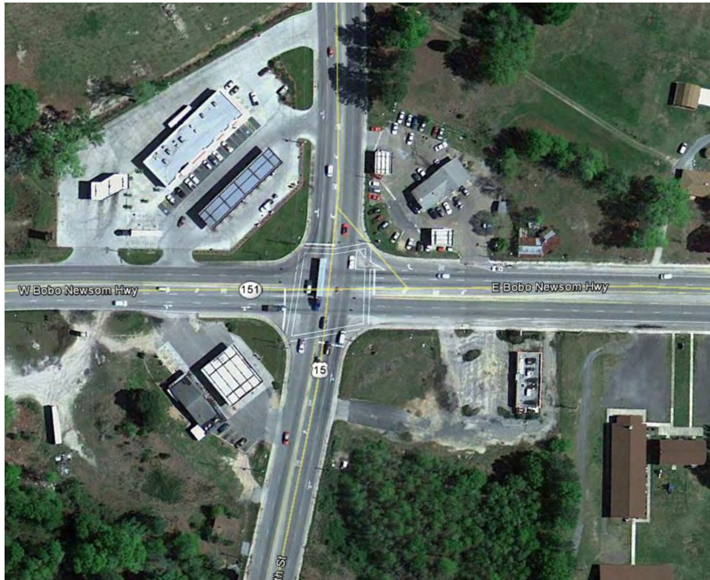
Gateways: 151 @ South 5th Street Existing

Entering Hartsville from the north side of the city along North 5th Street there is a natural entryway created by the intersection of North 5th Street and Society Avenue at the north side of Prestwood Lake. Existing Bald Cypress trees emphasize and enhance the 5th Street corridor as it begins to cross the lake. Proposed improvements include brick columns framing the south side of the intersection, a traffic pattern XD crosswalk, mast arm signalization and a landscaped median just before the beginning of the bridge.