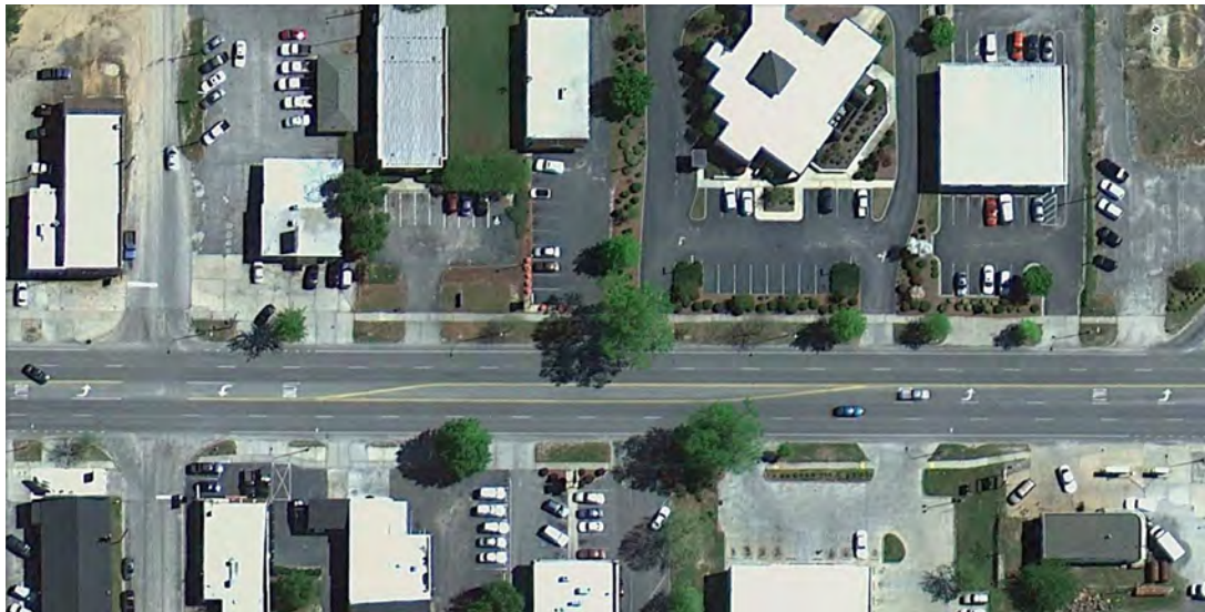
5th Street Corridor Existing