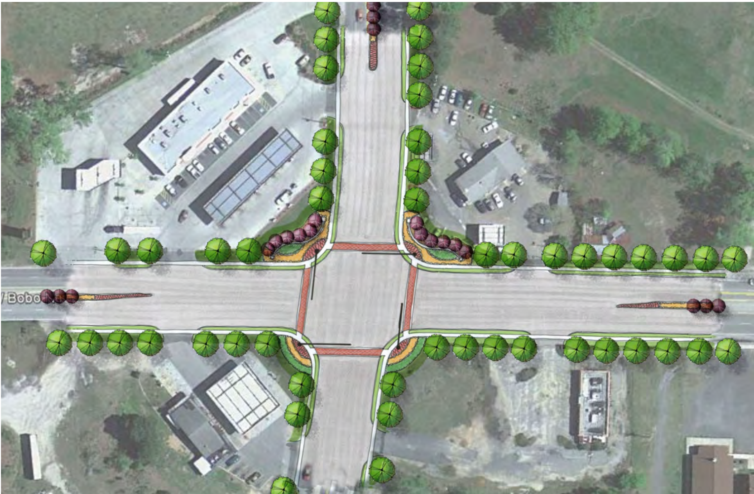
Gateways: 151 @ South 5th Street Concept 2

Both concepts use landscaping to direct views down the 5th Street corridor to invite curiosity and the desire to see more.