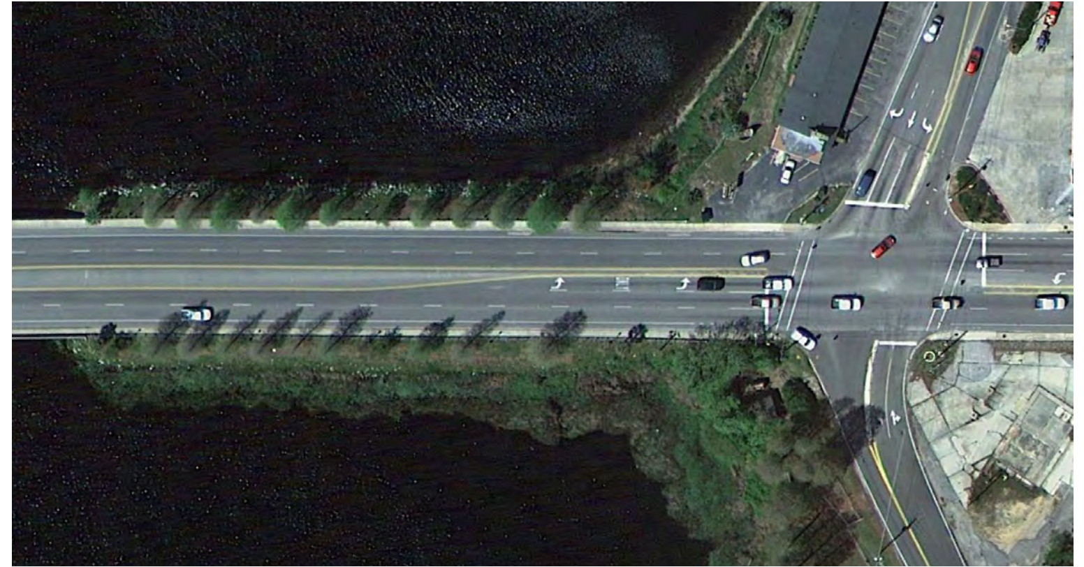
North 5th Gateway Existing