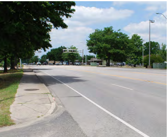
5th Street Corridor Existing