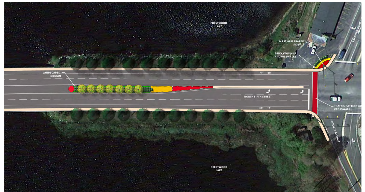
North 5th Gateway Concept