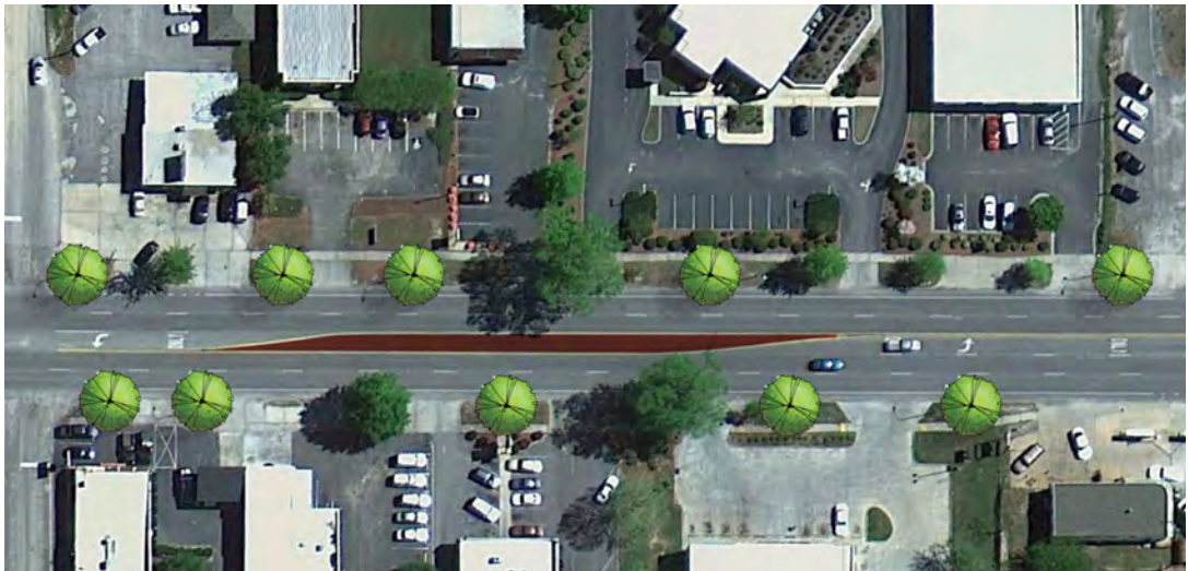
5th Street Corridor Concept A