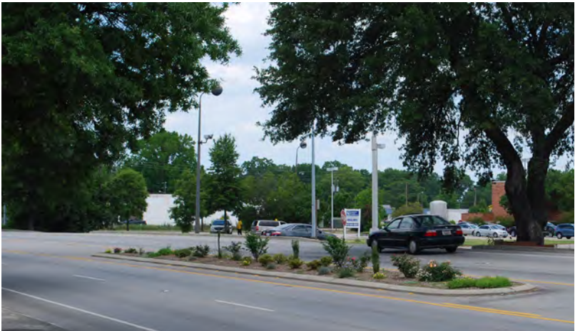
5th Street Corridor Existing