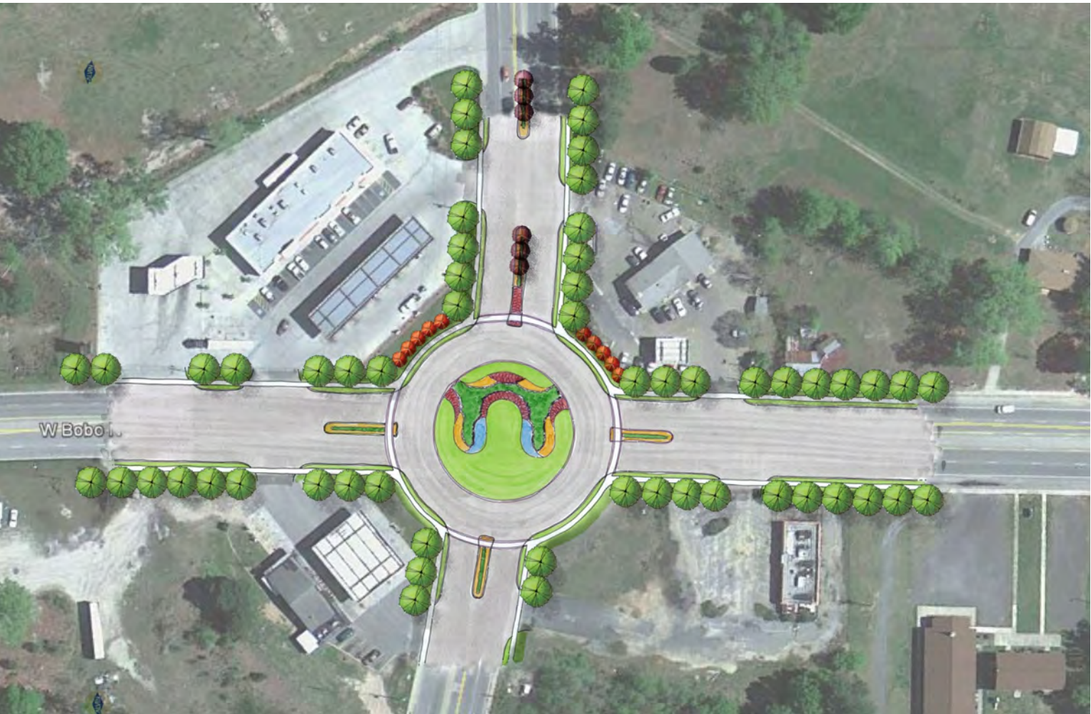
Gateways: 151 @ South 5th Street Concept 2