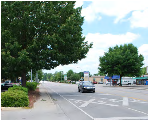
5th Street Corridor Existing