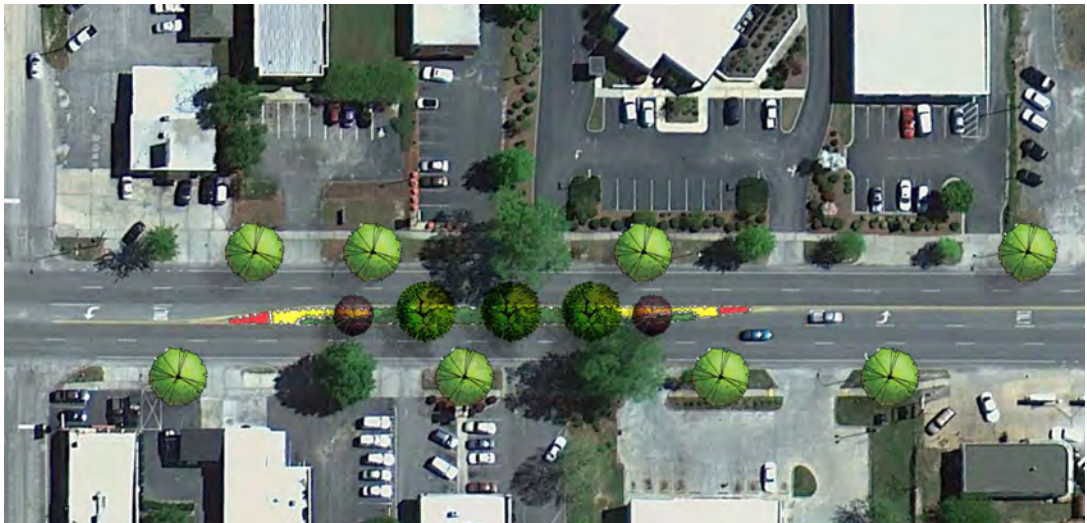
5th Street Corridor Concept B