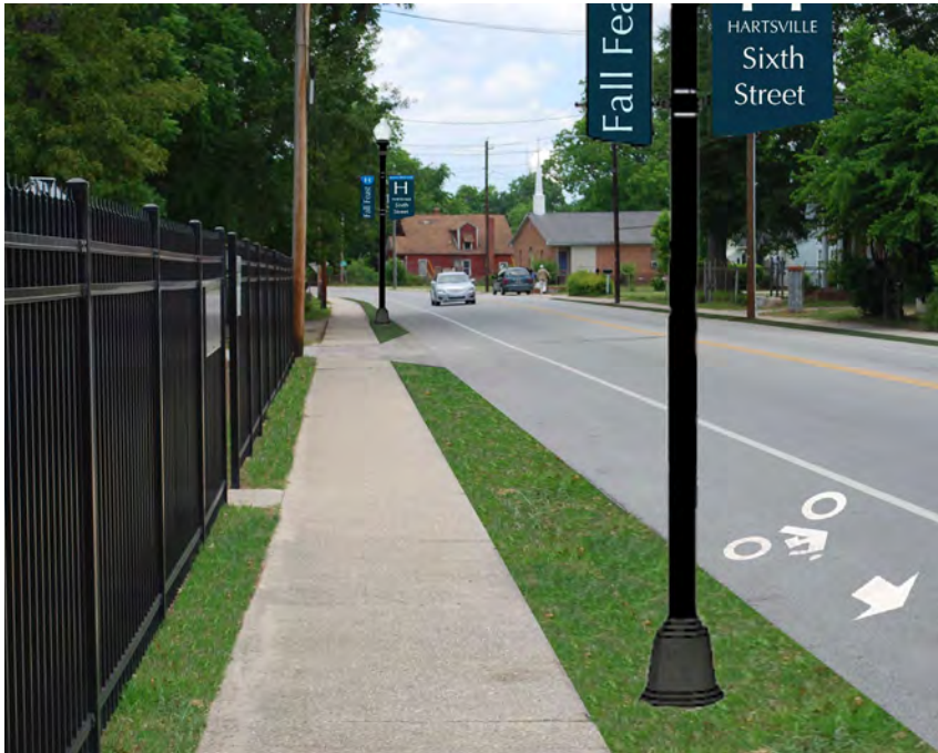
6th Street - Conceptual Improvements