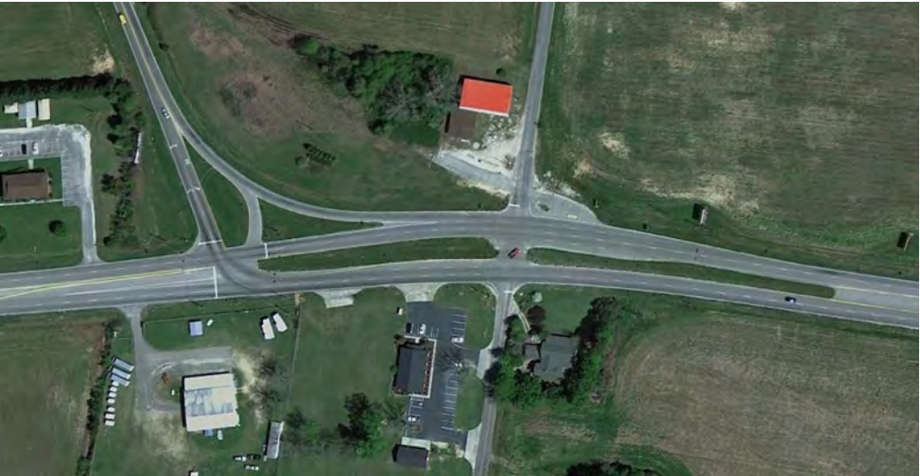
Gateways: 151 @ 4th Street Existing