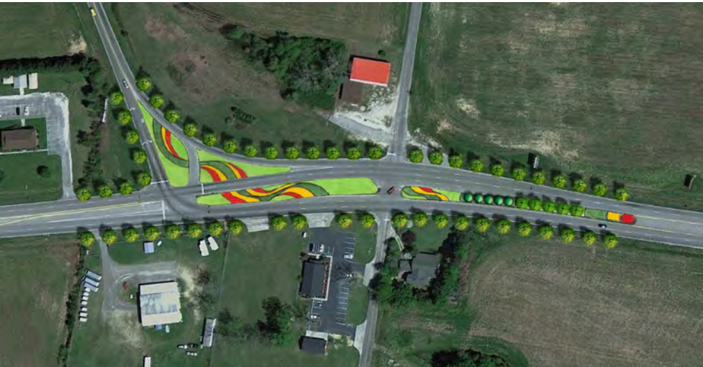
Gateways: 151 @ 4th Street Concept

The intersection of 4th Street and Highway 151 is very similar to the West Carolina Avenue and Highway 151 intersection as both have large triangular lawn areas existing between traffic lanes and transition lanes entering the Fourth Street corridor. Small plant beds or individual specimen plantings would be inconspicuous in these expansive open areas. Large flowing masses of landscape beds will provide the appropriate visual impact needed while also assisting in focalizing & minimizing maintenance requirements. Brick columns, decorative light fixtures with seasonal banners and gateway signage are encouraged at each major gateway location to begin to develop a consistent theme and city identity.