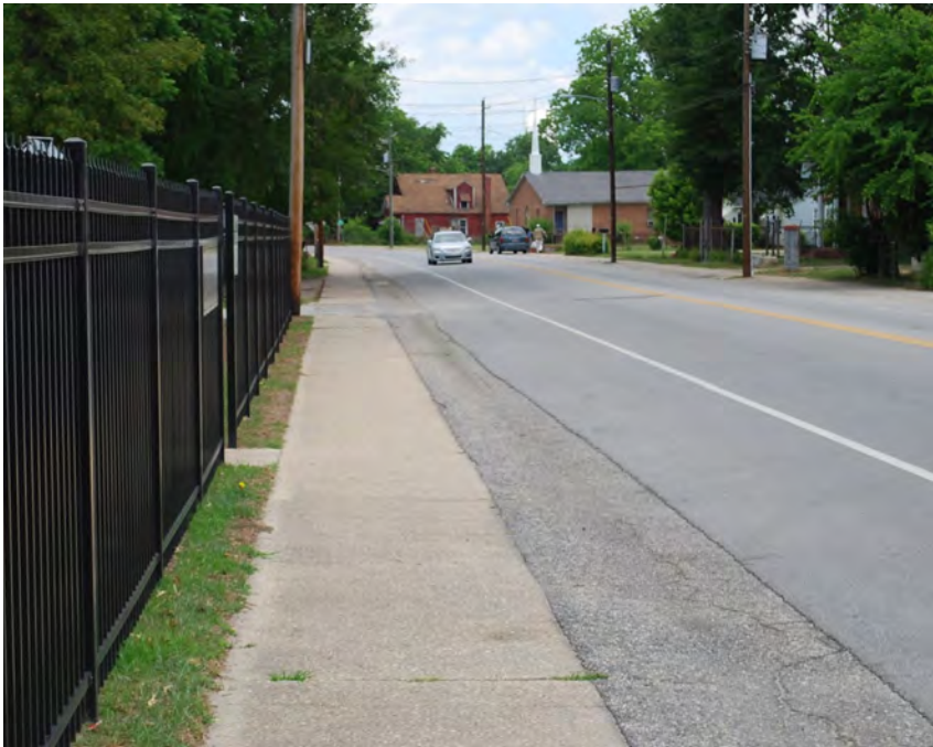
6th Street - Existing Conditions