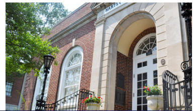
ARTS AND CULTURE