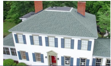
FOOD AND ACCOMMODATIONS